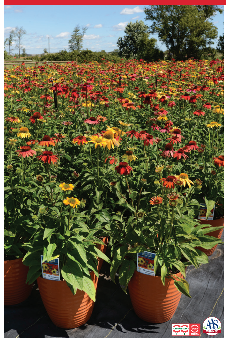
'Cheyenne Spirit' Echinacea

Select from some of the top performers from Kieft Seed<sup>™</sup> to enhance your perennial program. Rely on Kieft Seed perennials from PanAmerican Seed<sup>®</sup> for best-in-class genetics, exceptional seed quality, powerful bench-to-garden performance and dependable availability.