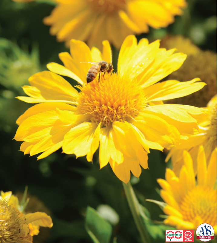
Mesa Yellow Gaillardia

An award-winning variety that delivers more colors and more flowers with a long retail shelf life, plus heat and drought tolerance and excellent Winter hardiness.