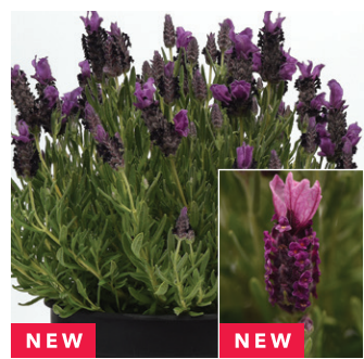
Bandera Deep Purple Lavender

This compact, semi-double yellow Coreopsis finishes 2 to 3 weeks earlier than Early Sunrise and other comparable varieties in the early cool season, and 1 to 2 weeks earlier in Summer.