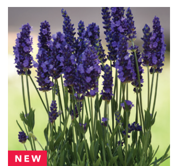
Blue Spear Lavender