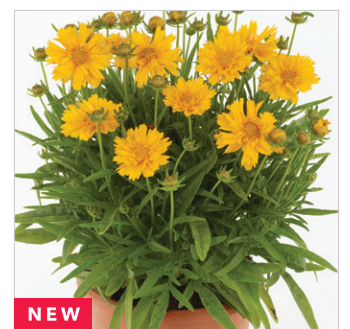
Double the Sun Coreopsis

This seed Lavender is the showiest English Lavender you can grow and sell, with big, tall spikes and upright flower stems that really stand out, even from a distance.