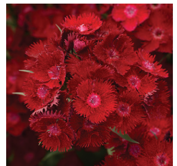
Rockin' Red Dianthus