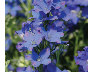
Diamonds Blue Delphinium