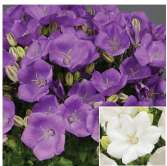
Rapido Blue Campanula