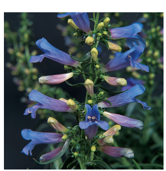
Electric Blue Penstemon

The first F<sub>1</sub> spurless Delphinium from seed provides more efficient young plant production, and sparkles in the garden with cerulean blue flowers that face upward.